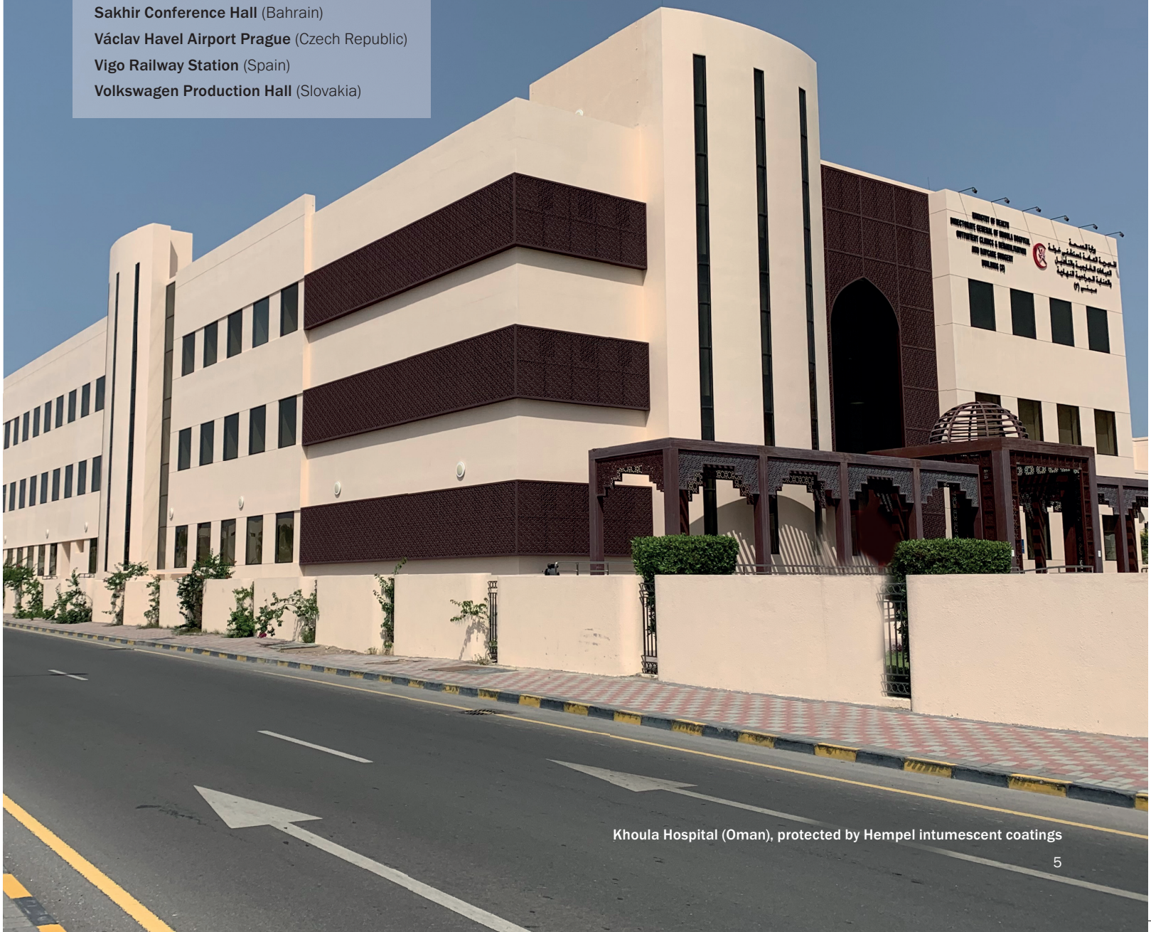
Khoula Hospital (Oman), protected by Hempel intumescent coatings

We are there every step of the way, offering advice, support and inspiration – and solutions that provide superior protection and performance.