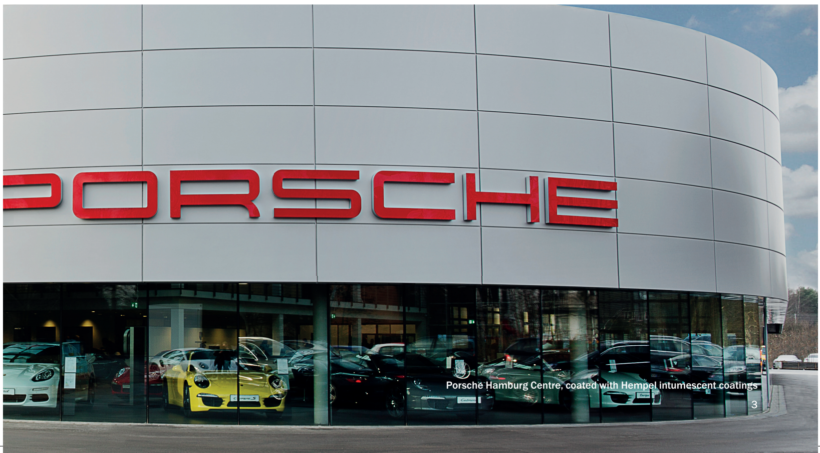
Porsche Hamburg Centre, coated with Hempel intumescent coatings

Use one product across I-sections and hollow sections. Specification and project management is simplified, especially in complex mixed structure projects and streamlined supply chain and operations.